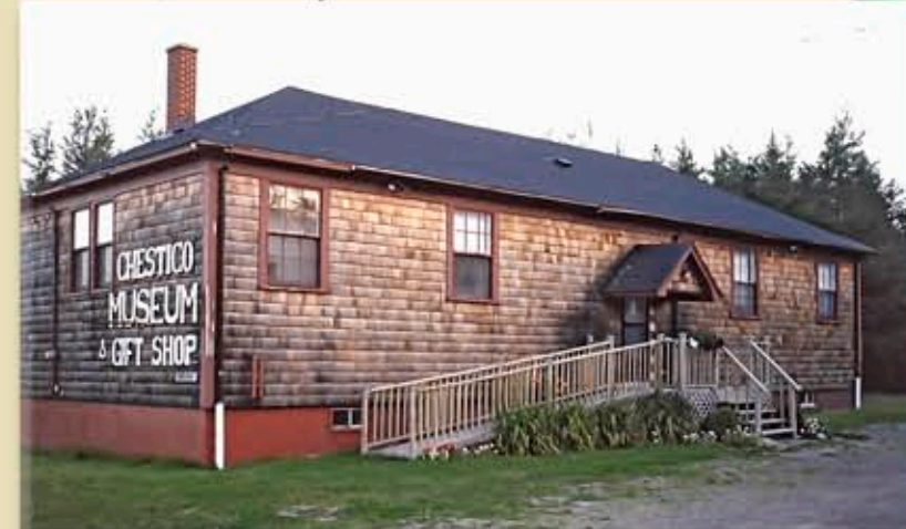
Chestico Museum at Harbourview