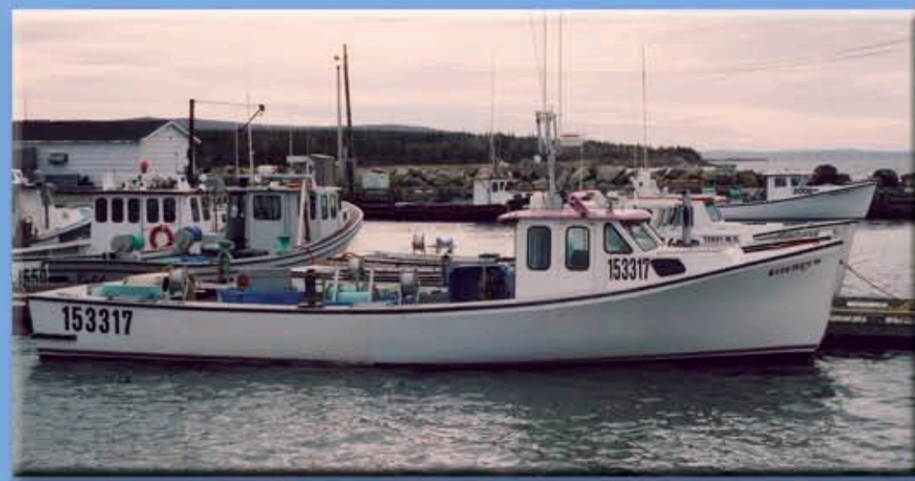
Baxter's Cove, one of 3 scenic Harbours in the Judique Area