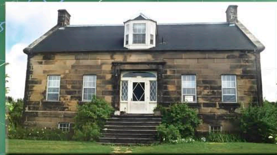
Stone House, Heritage Building, Main Street, Port Hood