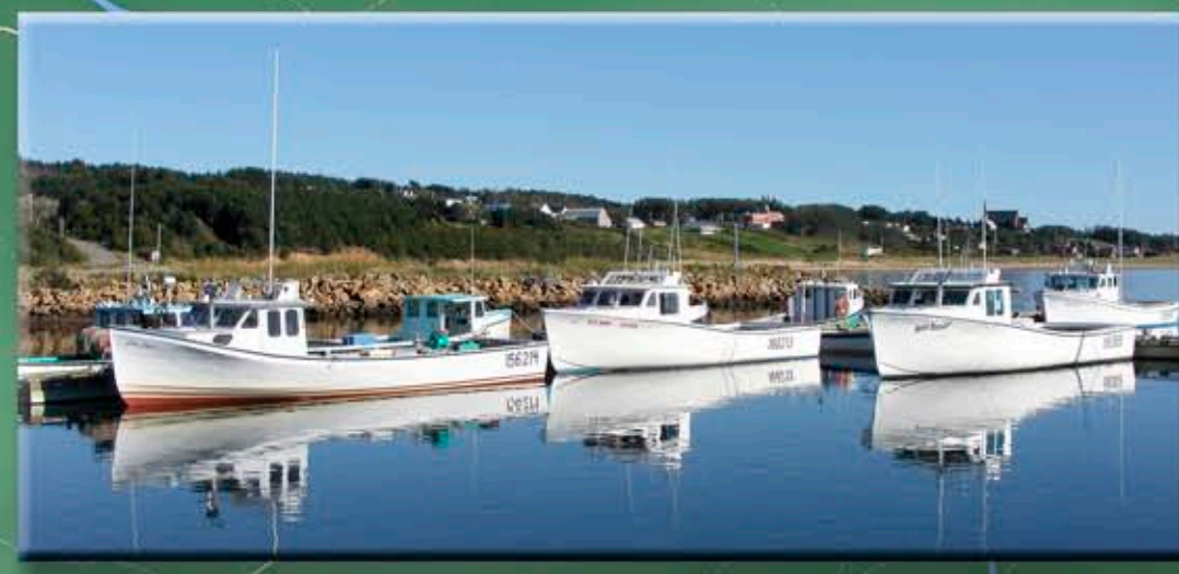
Murphy's Pond Harbour, Port Hood