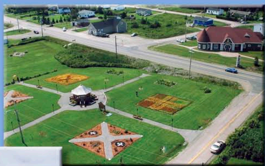
Tartan Gardens, Judique Centre