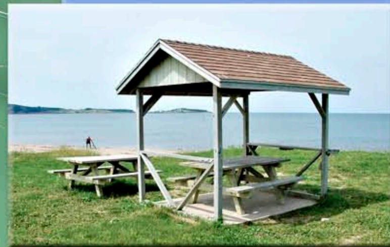
Picnic site near boardwalk, Port Hood Day Park