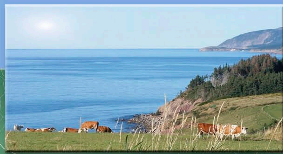
Scenic Colindale Rd from Port Hood to Mabou