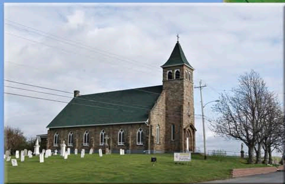
Historic St. Andrews Church, Judique